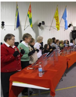
The Bell Choir rehearses. What beautiful sound!